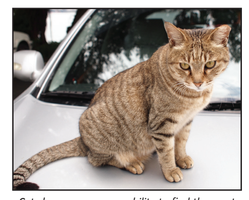
Cats have an uncanny ability to find the most valuable possesion you have, climb it and mark it with urine. Cars and trucks are favorites.

Note: factual content from Wikipedia, US Humane Society, US Center for Disease Control, US Federal Register Codebook, and others.