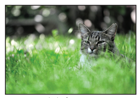
You may not think of your cat as an invasive species. But it is, in fact, a kind of superpredator, camouflaged by its affinity for humans, its playfulness and ingratiating independence.